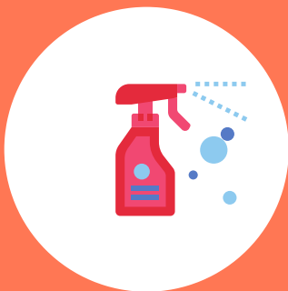
All Rooms Deep Cleaned Before Reopening