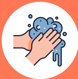
Hand Sanitisation on Arrival in Session Room