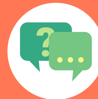
Session Feedback Delivered Online/Telephone