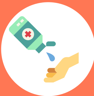
Sanitising Stations Throughout Office