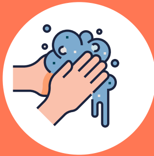
Handwashing on Arrival in Session Room