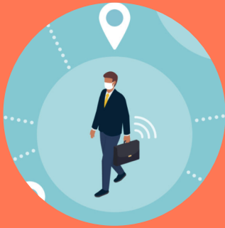
Track and Trace Info Taken