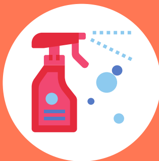
All Rooms Deep Cleaned Before Reopening