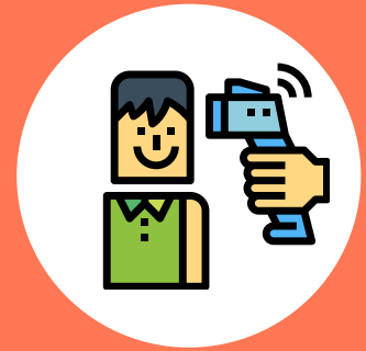
Temperature Check on Arrival