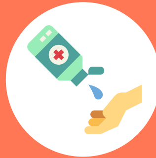
Sanitising Stations Throughout Office