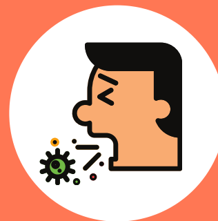
Any Sign of Symptoms - Postpone Sessions